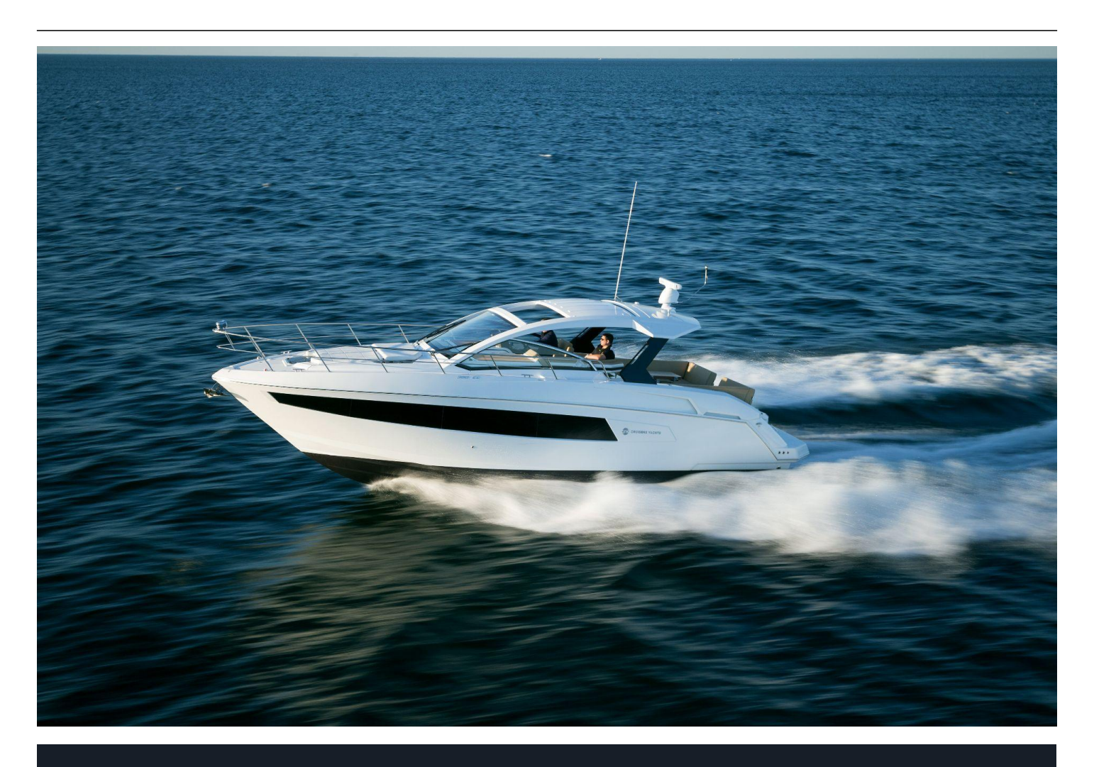
Cruisers Yachts 39 EC Cantius